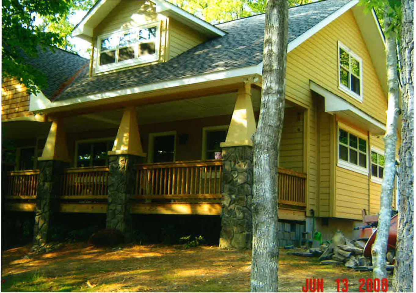
camp 6 2008

... .. ... .. ... .. ... .. ... .. ... .. ... .. ... .. ... .. ... ..