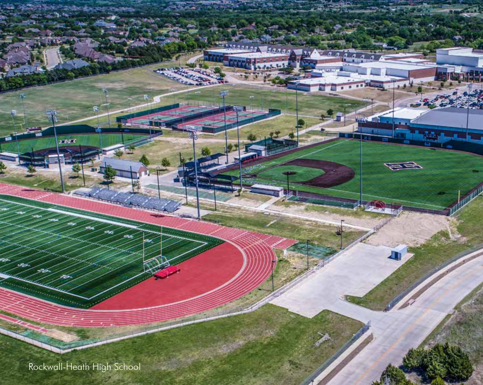
Rockwall-Heath High School

Another part of what makes Heath special is the peace of mind residents and businesses have knowing that the Heath Department of Public Safety is protecting and serving our community 24/7 with first responders who are triple certified as police officers, fire fighters and EMT's.