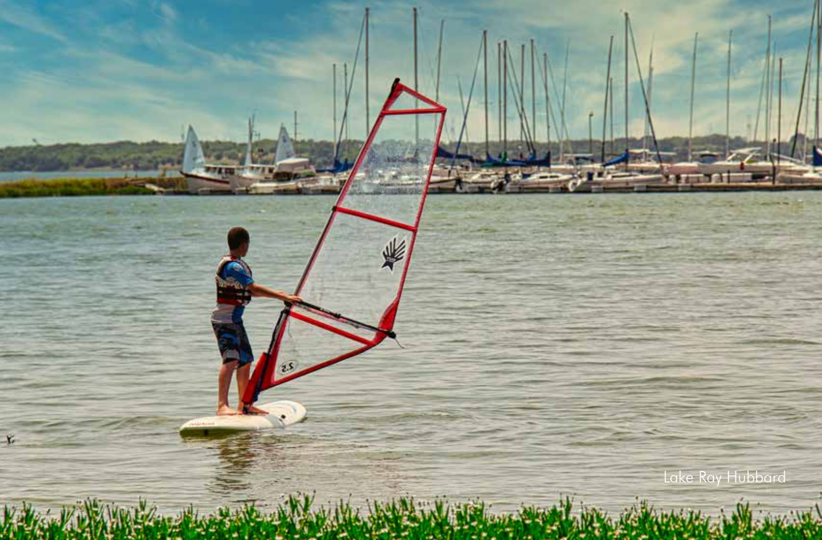
Lake Ray Hubbard

A mild year-round climate invites fishing, boating and water-skiing more days than not, and world class sailing can be found at Rush Creek Yacht Club. Buffalo Creek Golf Club is one of Texas' finest championship golf courses, and a new course at the master-planned Heath Golf & Yacht Club community is now open. In addition to the fields and facilities at Towne Center Park, there are boat ramps, a picnic pavilion and walking path at the waterfront Terry Park.