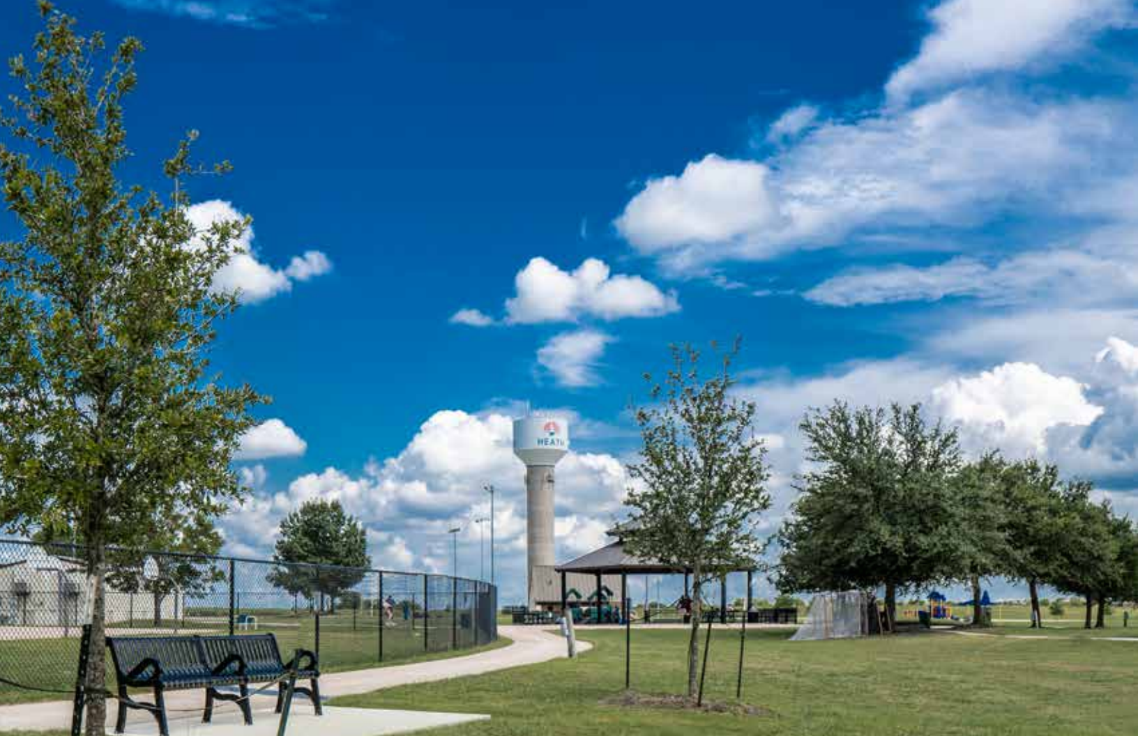
Towne Center Park

A bachelor's degree in accounting, finance, business or public administration, or a closely related field and at least five years of experience in progressively responsible government financial operations (municipal government strongly preferred), including at least three years of supervisory experience, is required. An equivalent combination of education, training, and experience will be considered. A Certified Public Accountant (CPA) license and/or a Certified Public Finance Officer (CPFO) from Government Finance Officers Association (GFOA) is preferred, but not required.