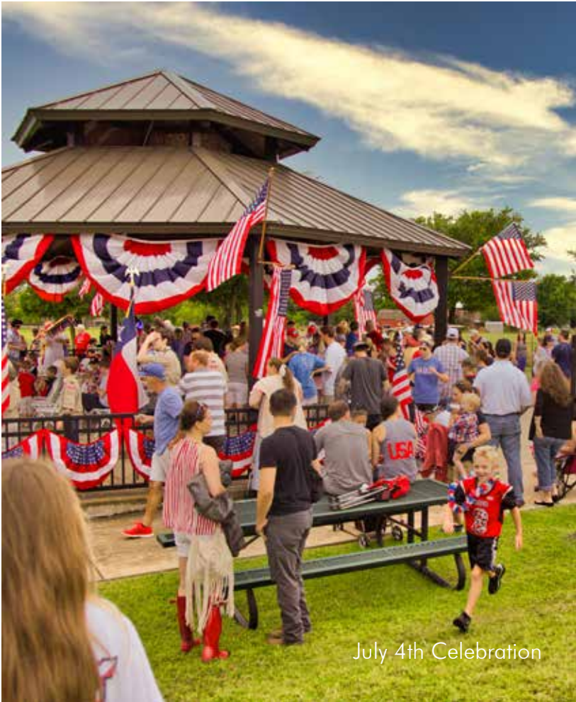
July 4th Celebration

With a recently updated Park and Recreation Master Plan, the city is dedicated to investing in park enhancements and a trail system that provides citywide connectivity including access to the Town Center Overlay District, where new retail and restaurant development is concentrated. Another new attraction is a dining and entertainment venue that's drawing both residents and visitors with its great food, music and fun. City-sponsored gatherings include seasonal events throughout the year.