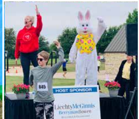
The event also included a Runners' Warm Up and tug of war competitions presented by Amy Hall of Camp Gladiator, a free stop at The Stretch Zone, complimentary refreshments from Tom Thumb and Café Hope Coffee and the Easter Bunny!