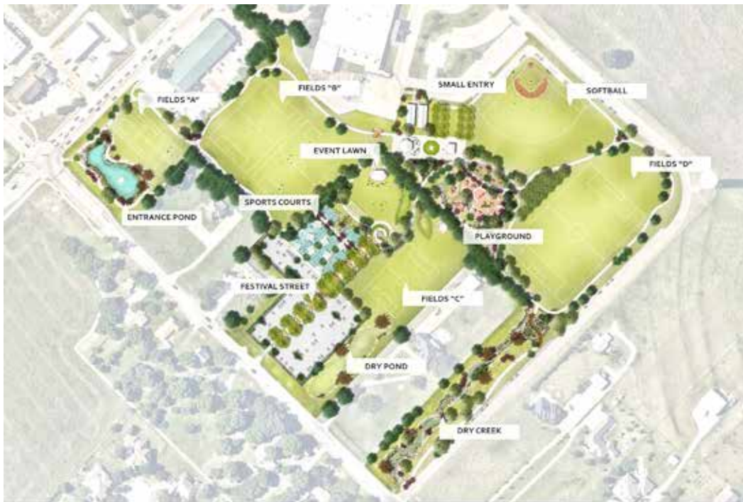
HEATH TOWNE CENTER PARK Illustrative Site Plan Overview